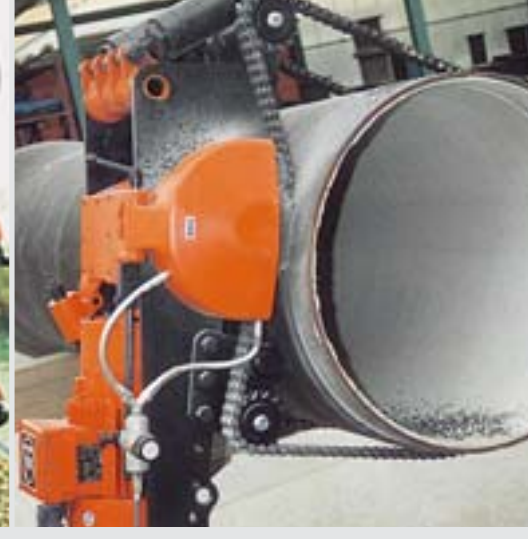
In pipeline construction.