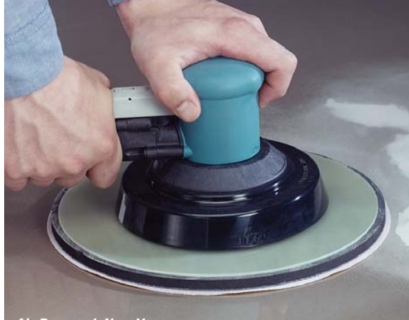
Air Powered, Non-Vacuum

Lever prevents accidental start-up of tool. Has no sharp edges or "pinch points."