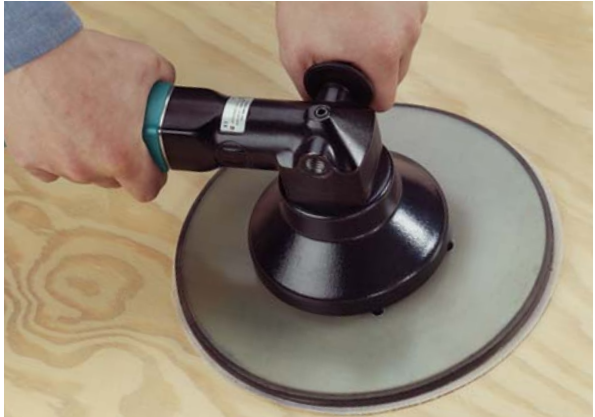
Air Powered, Non-Vacuum