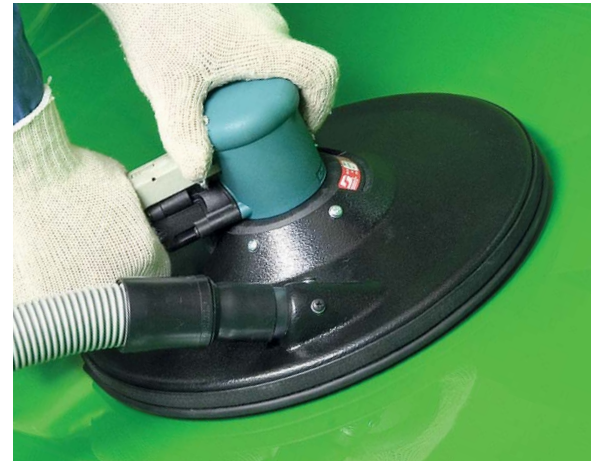
Air Powered, Vacuum-Ready