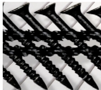
InvisiDeck® SCRAIL ®