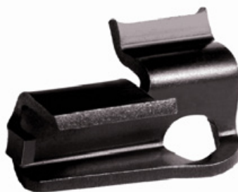
InvisiDeck® I-CLP CLIP