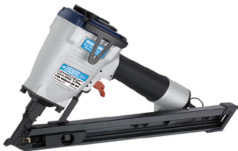
InvisiDeck® #F36 RHN33-38 DT