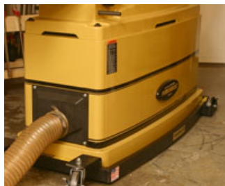
The all-steel base cabinet provides solid footing, houses the motor and sends the dust to the 4"-diameter port.

The fully welded, all steel base cabinet provides a solid platform for the PJ-882HH 8" Parallelogram Jointer. At 20 ½"-long by 15"-deep and 20 ½"-tall, the base cabinet puts the PJ-882HH 8" Parallelogram Jointer bed at a comfortable 31 5/16" above the floor.