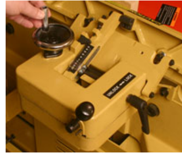
The fence has an insert (left) that prevents scratching the table when it is moved. The operating mechanism (right) allows precise bevel setting and a very stable fence when locked.

The fence has adjustable stops at 90-degrees (vertical) and 45-degrees in or out. Changing fence angles is made especially precise by a rack and pinion gear drive system operated by a 3 3/4"-diameter cast iron handwheel fitted with a spinner handle. A large lever locks the fence at any bevel angle desired. Of course, the fence can be positioned at any point across the width of the tables and is locked with a separate handle.