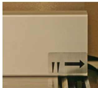
Our controlled chip, three knife cutterhead feature jack screws (arrow, left photo) that make setting precise knife heights very easy. We also include a simple knife-setting jig (right). When the knife is at the correct height, if the first arrow is placed at the end of the outfeed table and the knife rotated under the jig, the jig should move so the second mark is at the edge of the outfeed table.

surface easy. We even include an easy to use knife setting block to make the alignment process faster and easier.