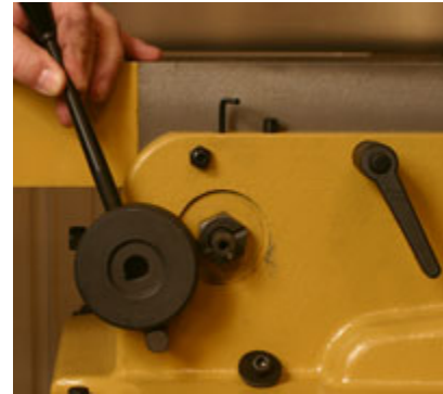
Each corner of the infeed and outfeed tables has an adjustable cam for correcting coplanar misalignments. The outboard cams on the front of the machine are under the height levers.

For a jointer to straighten wood accurately the infeed and outfeed tables must be coplanar - perfectly aligned with each other side-to-side and front-to-back. The tables on the PJ-882HH 8" Parallelogram Jointer have been accurately aligned at the factory but they could possibly need adjustment in the future. To make those once complicated adjustments much easier we built in special cams, two on the front and two on the rear of each table. These cams allow the user to correct this alignment should that become necessary and do it quickly saving time and money.