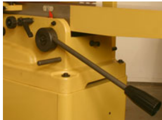
Both tables use levers to adjust their heights. The infeed table lever is augmented by an automatic depth limiter that can be released for deep cuts with the twist of a small knob.

The outfeed table is fitted with limiting stops that control the full up and full down travel. A lever moves the outfeed table up and down and another lever locks it in place. Rabbits up to 1/2" by 1/2" can be cut on the PJ-882 8" Parallelogram Jointer. Note: Rabbits cannot be cut with the models equipped with the helical cutterhead.