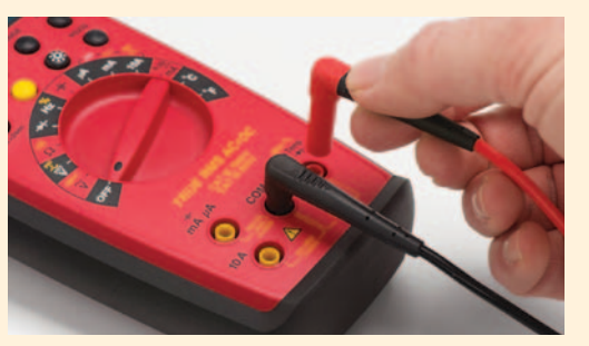
Universal plugs compatible with all 4 mm shrouded inputs