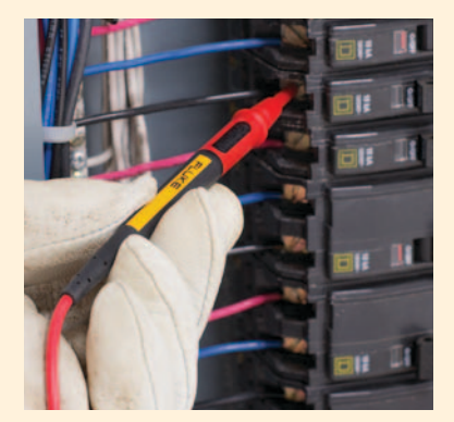
Reduce tip exposure for CAT III testing