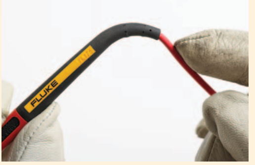
Reduce tip exposure for accurate placement