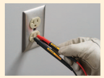
Increase tip exposure for CAT II probing